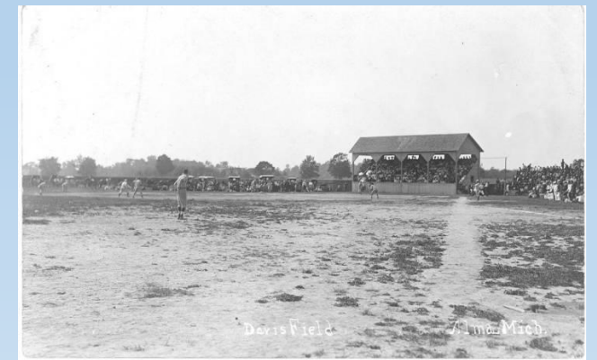
Davis Field in the early 1900's

This was a big year for the small town of Alma. It gave the community and the college a sense of “belonging.” In other words, it put them on the map. In respect to sports at least, Alma had proved it was a force to be reckoned with.